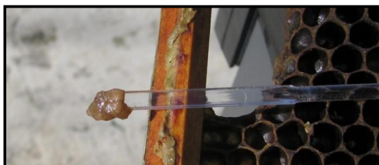
Larvae with a brown colour

This disease form has been designed to recognize the clinical signs of the disease in the honeybee colony.